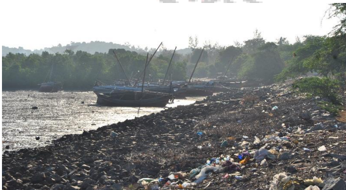
Litter on the shoreline of Ungwana-Malindi Bay

Land-based activities resulting in the discharge of municipal, industrial and agricultural wastes and terrestrial run-off account for about 80 per cent of all marine pollution. Sewage and waste water discharge, nutrients, heavy metals, organic pollutants such as pesticides, oils, sediments and plastic debris, discharged by rivers or directly from terrestrial run-off into coastal waters, lakes and other water bodies, pose adverse effects on aquatic ecosystems as well as human health and well-being.