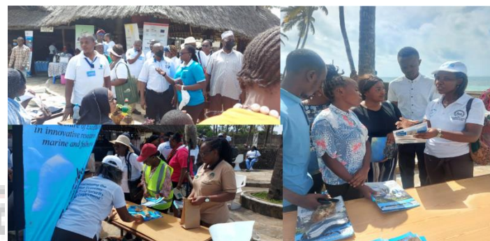
KMFRI's exhibition stand was a beehive of activities

While displaying some of her research work at the exhibition stands set up by the event organizers, KMFRI was delighted to share information about her research activities with participants attending the function. KMFRI used the opportunity to create awareness about her products to participants who visited her exhibition stand.