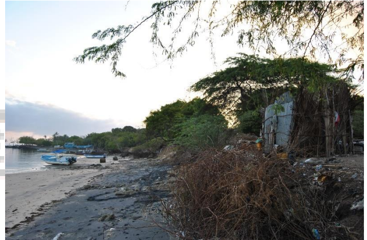
Plastic litter on the shoreline of Malindi-Ungwana Bay beach shoreline.

Thus the ultimate effects of these challenges, unless curtailed by implementation of effective policies, could pose a serious threat to the achievement of the intended ecological, socioeconomic and other benefits.