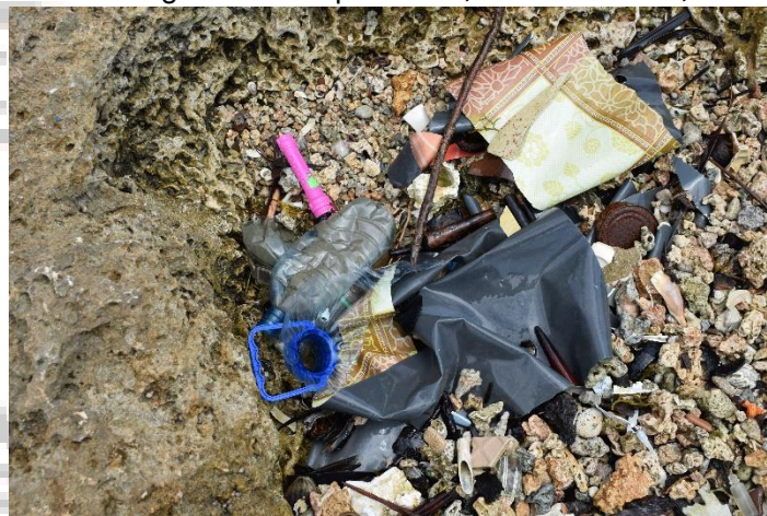
Plastic waste washed to the shore in Kwale County

Under the Act, the National Environment Council (NEC) has been established, the functions of which include policy formulation and direction. Also established under the Act is the National Environment Management Authority (NEMA), whose role is to exercise general supervision, coordination, and