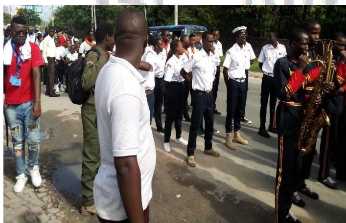
Procession band gets ready

Members drawn from the Institute joined marine and maritime stakeholders in the celebrations that were characterized by a band procession and panel discussions, leaving no doubt that the society understands the crucial role of the ocean for their well-being.