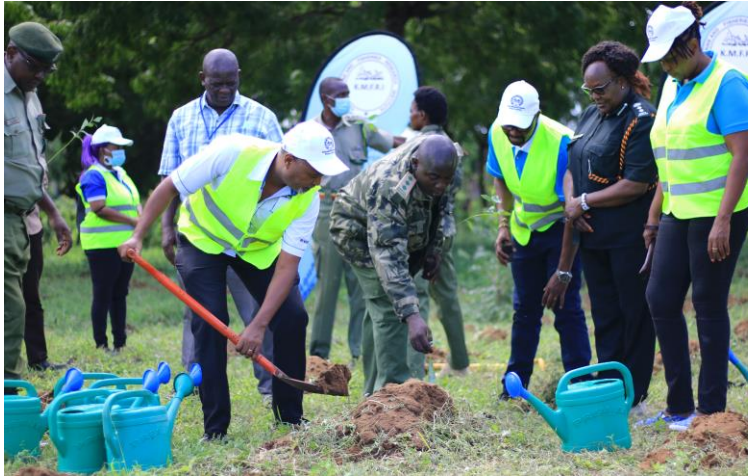
KMFRI team with prison officials at Shimo la Tewa-Borston during a tree-planting event. The seedlings were donated by KMFRI