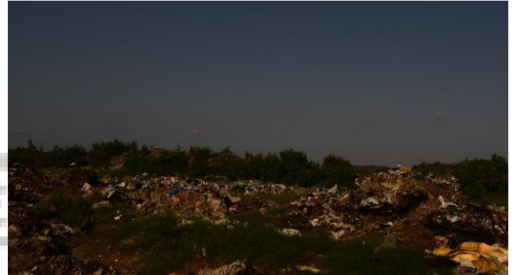
A pile of garbage at Mwakirunge dumpsite in Mombasa

Eutrophication, a consequence of excessive input of nutrients to the aquatic systems, represents a serious threat to the integrity of the ecosystems and the resources they support, such as fisheries. Proliferation of harmful algal blooms (HABs), a consequence of eutrophication, has been associated with degradation of water quality, destruction of economically important fisheries and public health concerns.