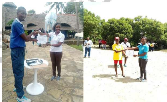
KMFRI awarded certificates of active participation.