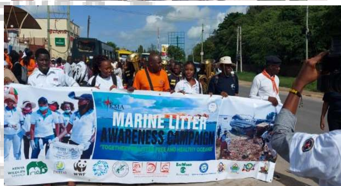
Procession for the World Oceans Day

participate in an array of build-up activities that included beach-clean ups in Watamu, Kwale County, ahead of the main celebrations.