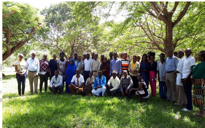
Group photo of partners involved in the Blue Empowerment project

The project is led by Africa Centre for Technology Studies (ACTS). Besides KMFRI, the other partners are Kenya Industrial Research and Development Institute (KIRDI), Bahari CBO Network, Kenyatta University (KU), C-Weeds Corporation Ltd, and the people of Kwale and Kilifi Counties of Kenya.