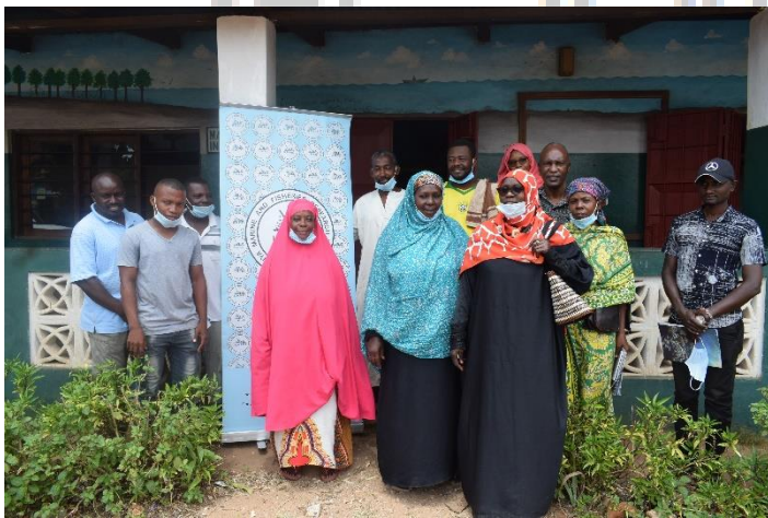
Gazi participants after the forum

environment. Participants comprised of county officials, BMUs representatives, fishers and fisheries officers were educated on the nexus between the fisheries resources and marine pollution.