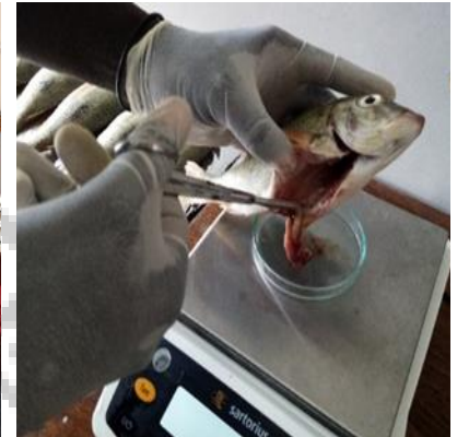
Removal of gastrointestinal tracks

According to the results, four fish out of 30 samples in Gazi Bay had ingested microplastics with the majority-45% - having swallowed green particles followed by grey particles at 33%.