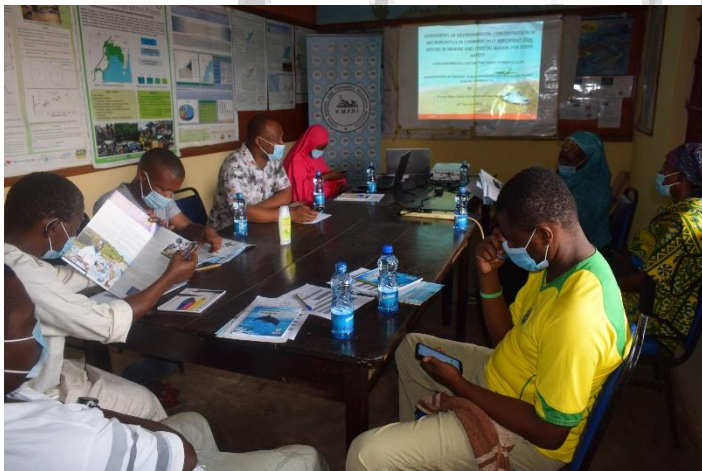
Participants peruse KMFRI's IEC materials shortly before the forum.

Participants also received KMFRI's information, education and communication materials. They were also sensitized on redress mechanisms in the event the quality of products and services received from the Institute does not conform to the prescribed standards.