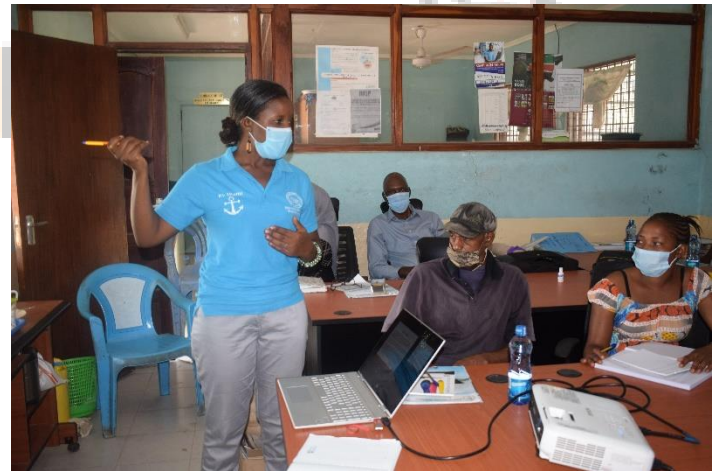
Fisheries stakeholders being sensitized on KMFRI's products and services