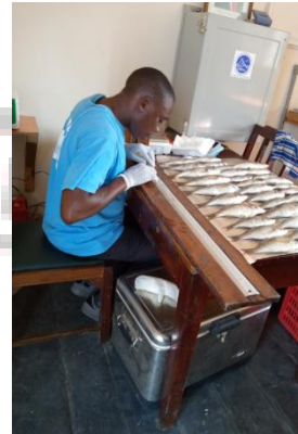
Recording of fish biometrics

sorted under a dissecting microscope and characterized according to their types, sizes and colours.