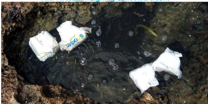
Used diapers floating on the shores of the ocean in Shimoni