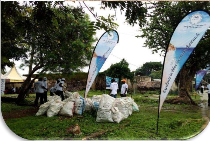
Top, KMFRI marine pollution research expert Dr Eric Okuku during a beach cleanup in along Shimoni beach. Bottom, KMFRI team weighing collected trash.