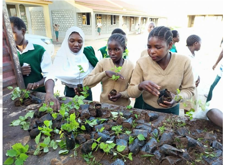
Students from five different schools in Ganze constituency sample seedlings donated by KMFRI in an initiative aimed at increasing forest cover to curb the adverse effects of climate change.