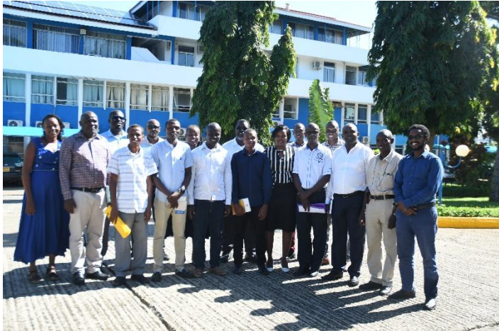
KMFRI staff with officers from the Kenya Fisheries Services (KeFS) who were on a benchmarking tour to our institution.