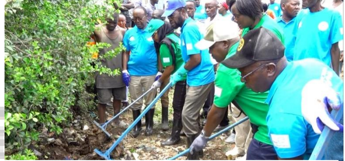
Kisumu Governor Hon Anyang' Nyong'o leading in the clean-up

Entertainment, Kids Fun Fair, Exhibitions, Symposia,