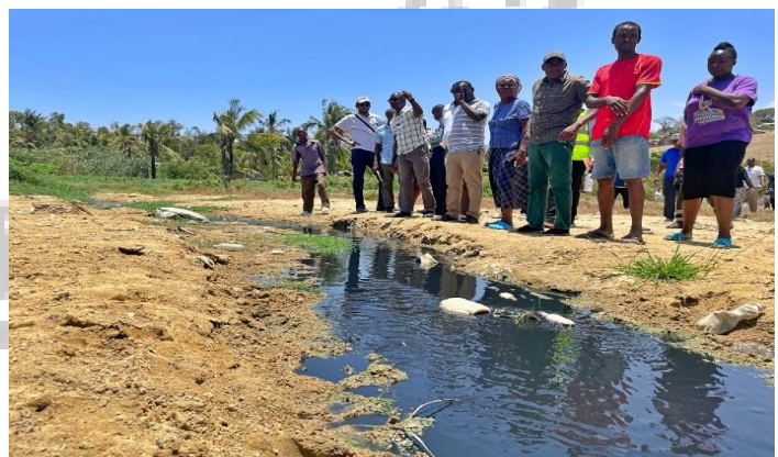
How sewage flows through the Mikindani estate area

“This raw sewage carries with it a lot of bacteria from the medicine we consume to the oil we smear our bodies with. All this gets into the sewage and once we use this water again to irrigate our crops, we directly or indirectly endanger ourselves and even the marine organisms in the ocean where the untreated sewage