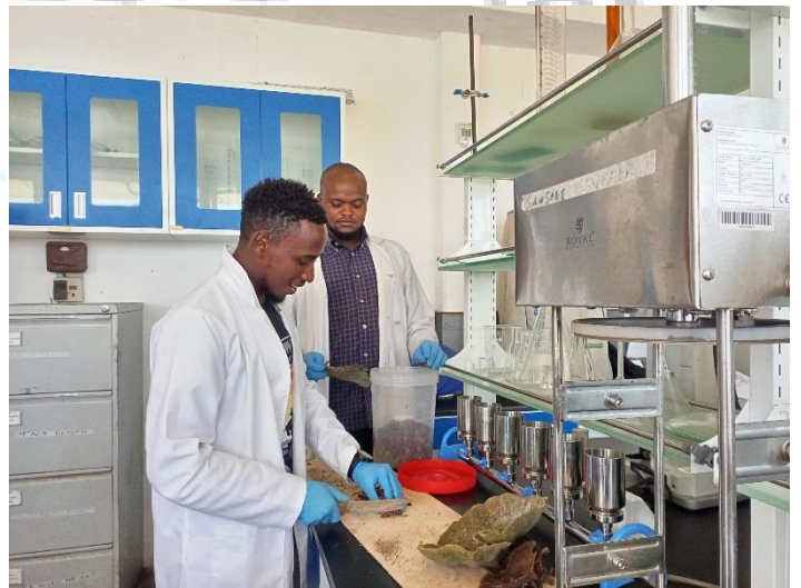
KMFRI staff prepare samples collected in the ocean