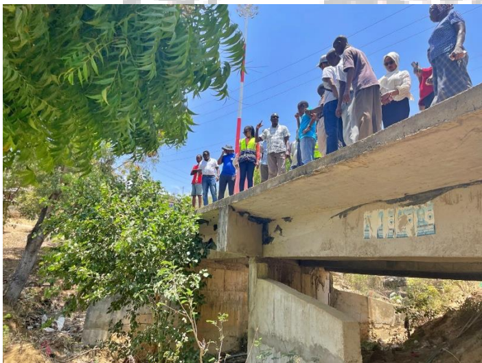
A photo illustrating how the landslides have affected the Mikindani area

Mikindani area has in the past been affected by landslides occasioned by rains and poor soils. This intervention will therefore act as a barrier to the landslides witnessed in the area that have been wreaking havoc on the locals. The initiative will also seek to cushion the people from the damaging effects of the natural calamity by reinforcing walls on the perimeter, and growing vetiver grass which is effective in holding the soil together in areas prone to erosion like Mikindani.