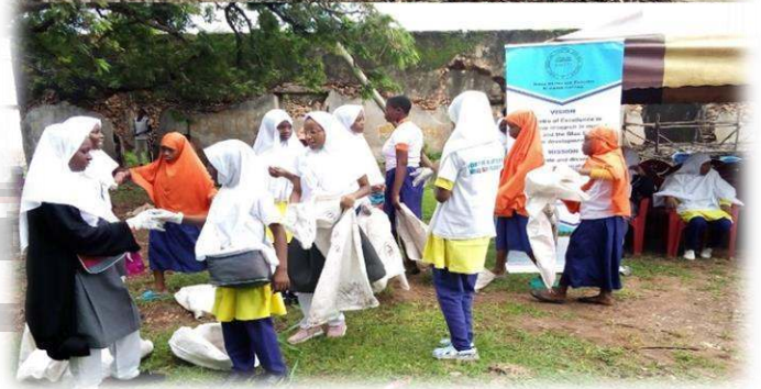
Kwale residents actively participate during the launch of a marine litter campaign in Shimoni, Kwale County.