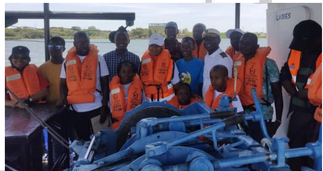
Visitors onboard KMFRI Research Vessel Uvumbuzi

The Maritime Department sensitized the locals on the Blue Economy and Freshwater research activities being done in Lake Victoria using the Research Vessel Uvumbuzi . The engagement sought to promote Blue Tourism through participation in recreational fishing, a sport whose potential remains underexploited within