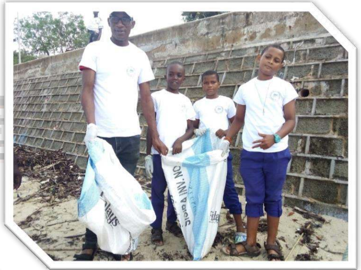
Wasini Primary School pupils pose for a photo during the launch of marine litter campaign dubbed 'Don't be a Litter Bug Use Less Plastics' organized by KMFRI