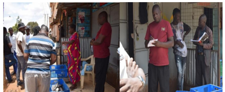
Customers buy fresh fish and traders taking interview from KMFRI scientists in Eldoret fresh fish market in March 2023

Following the findings, KMFRI researchers recommended development of stringent measures to enforce fishery regulations in Monitoring, Control and Surveillance (MCS) of L. Turkana fishery by the county government.