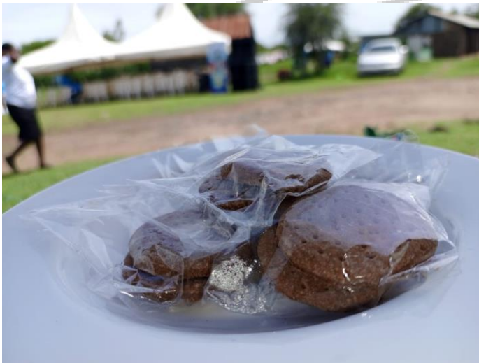
Omena biscuits sample displayed at the event

Post-Harvest Analysis and Natural Resources team also had the opportunity to exhibit their products in the fish fiesta event. Here, different products made from fish, fish waste and fish by-products were displayed to make the day colourful. The products were fish oil, fish flowers made from fish scale, omena biscuit, and fish gelatin, among others.