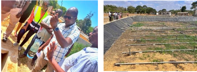
Left, treated water at the Shimo La Tewa constructed wetland Right, how they are using the water for irrigation

KMFRI is tasked with keeping the marine ecosystem clean and devoid of contaminants, and the discharge