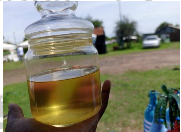
Sample of fish oil displayed at the event

Kisumu county clean by properly managing waste using the 5Rs: Reuse, Recycle, Reduce, Refuse, and Repurpose. There was also a freshwater aquarium