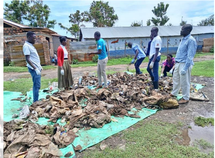
KMFRI team segregating garbage after clean up

Kenya Lake Debris Voluntary Program showcased garbage collection, waste management (waste