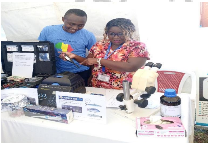
Principal laboratory analyst walks a client through various laboratory equipment being showcased.

The attendees were also sensitized on how to keep