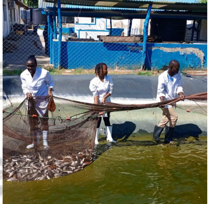
Mariculture team during a fish pond cleaning exercise. During this exercise, fingerlings are also harvested.