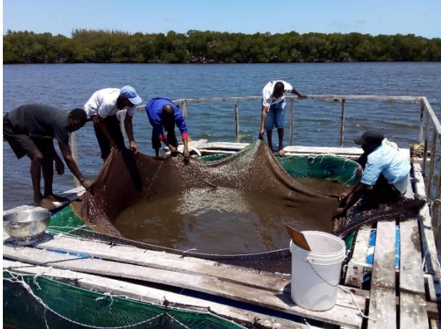
Sampling of marine organisms stocked in cages at Dabaso Creek