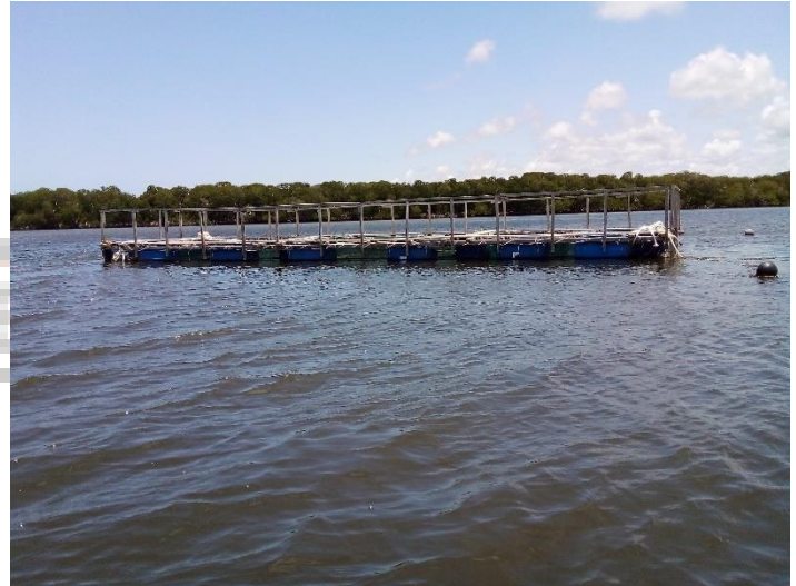
Photo of a wooden fish cage at Dabaso Creek

Each of the experimental models had a duplicate giving a total of 6 cage compartments for the experiment. Feeding was done twice every day at 10 am and 4.00 pm at 3% bodyweight with 48% Crude protein content feed formulated at the KMFRI Mombasa station. Sampling was done after every two weeks to obtain the length and weight of organisms which could be used to adjust the feeding ration.