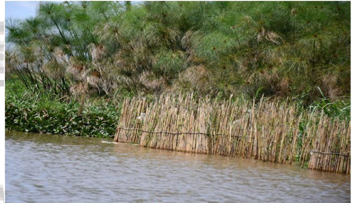
Common reed traps laid for seed and broodstock collection in Lake Victoria

The communities also conserve fish in dams and dig trenches along the rivers so that when it rains, the fish swim against the direction of water moving downstream and end up in the trenches, which stops them from swimming into the lakes.