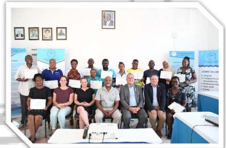
KMFRI researchers display certificates after completion of data management and publication training course aimed at exchanging data management and publication expertise and strengthening bilateral cooperation between KMFRI and Flanders Marine Institute (VLIZ).