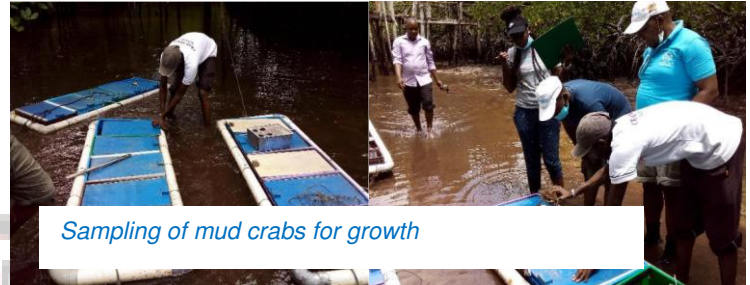
Sampling of mud crabs for growth

Feeding was done. The growth of the crabs being cultured was assessed every two weeks and involved measuring weight and carapace length using a portable kitchen balance and a ruler respectively.