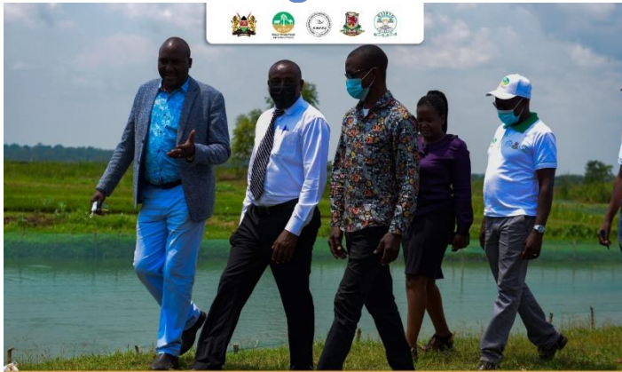
TRAINING AND DISSEMINATION OF NUTRIENT RICH FISH DIETS, FISH POST-HARVEST AND VALUE ADDITION TECHNOLOGIES IN BUSIA COUNTY FROM 20 th - 22 nd FEBRUARY 2022