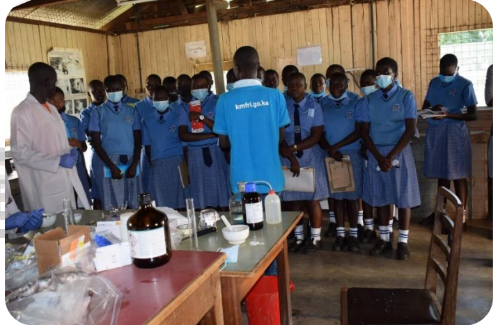
KMFRI Kisumu staff make presentations to students from St Chrisphine Samia Girls Secondary School who were on an academic tour of the research centre.