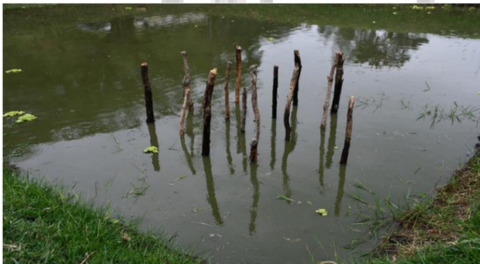
Wood sticks used for periphyton technology in an earthen pond.

Sex identification is done by examining fish genital papilla, body formation and body colour in Nile tilapia. The fish are fed on worms, termites and sweet potatoes, kales and cassava leaves. Some farmers also to feed tilapia in their ponds with duckweed.