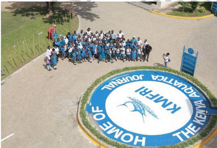
Pupils from Jeddy's Academy and Busy Bee Kindergarten and primary schools during their tour of KMFRI, Mombasa. They dived into the world of coral reefs through Virtual Reality, explored the microscopic fauna and flora in the labs, and experienced marine habitats at the aquarium and museum.