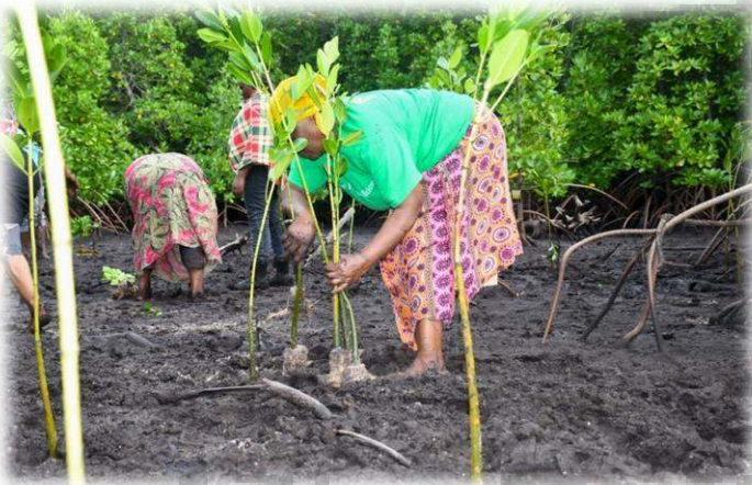
Women from Gogoni-Gazi Community Forest Association members plant mangrove seedlings in Chale Island, Kwale County during a tree-planting exercise conducted by KMFRI