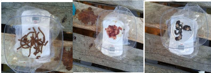
Formulated diet, Gastropod flesh and trash fish

T. palustris was collected from a mangrove forest along Gazi-Bay, Kenya. Then, flesh from each individual was collected and stored in a refrigerator. Part of the flesh was used to formulate an inert diet (diet 1) as a major ingredient for protein. The remaining part was fed directly as a fresh diet (diet 2). Trash fish (diet 3) were purchased from local small-scale fishermen and were also preserved in the refrigerator for routine feeding. Diet 4 was a blend between T. palustris and trash fish.