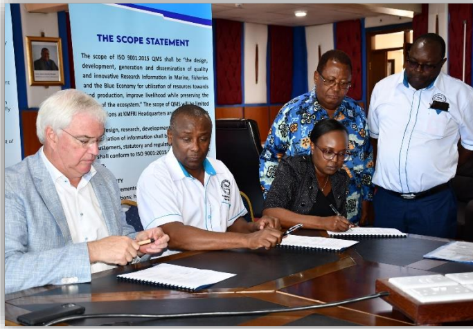
Belgium's Flanders VLIZ and KMFRI through the State Department for Blue Economy and Fisheries sign a Memorandum of Understanding (MoU) for cooperation, collaboration, and partnership in marine research and capacity building.