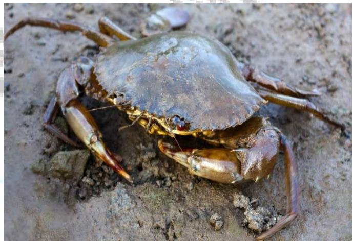
Image of a mud crab

KMFRI's mariculture team developed an inert diet for juvenile mud crab that was formulated using T. palustris flesh as an alternative source of protein and compared its performance against two commonly used fresh flesh feed (Trash fish and T. palustris ).