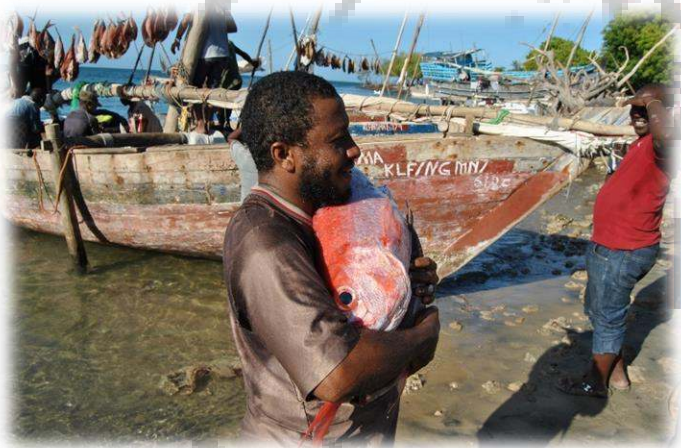
A fisherman in Ngomeni, Malindi, carries a red-snapper

Acoustic soundings revealed highly productive deep sea canyons with high unique fishery, opening new fishing frontiers at NKBs. The fisheries resources however have not been exploited.