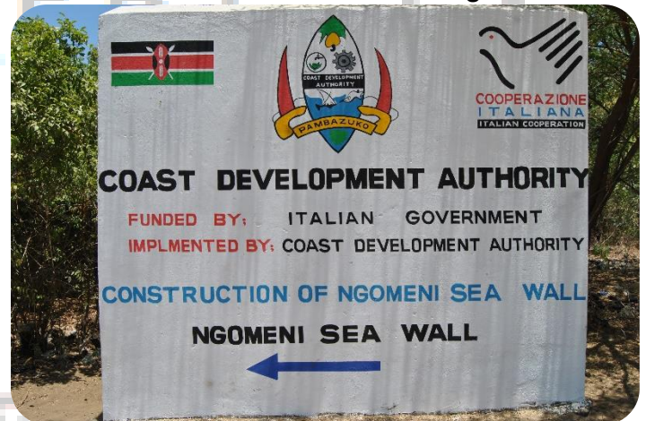
A signboard in Ngomeni, Malindi