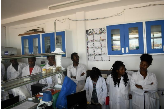
Students from Chuka University pursuing a Marine Biology course during their tour of KMFR I's lab facilities where they gained practical knowledge of the lab operations. KMFR I's research experts were on hand to share information on fish culture, aquaculture, management exploitation, conservation of marine resources, deep-sea ecology, and marine species diversity.