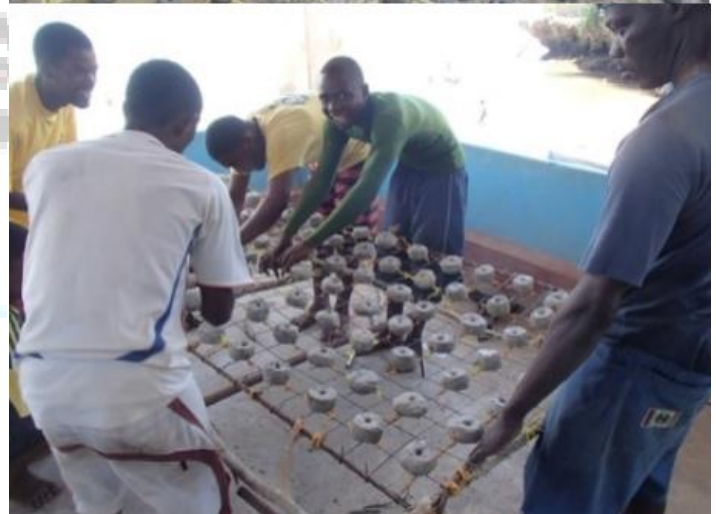
Wasini people collect coral fragments from donor healthy coral reefs for transplanting

Some content in this article was extracted from a paper written by a Blue Economy enthusiast