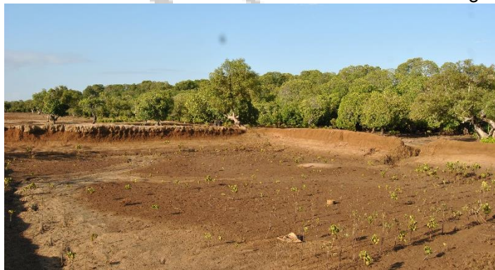
Mangroves in Malindi-Kilifi County.

KMFRI in collaboration with coastal communities has been implementing projects to curb the adverse effects of climate change.