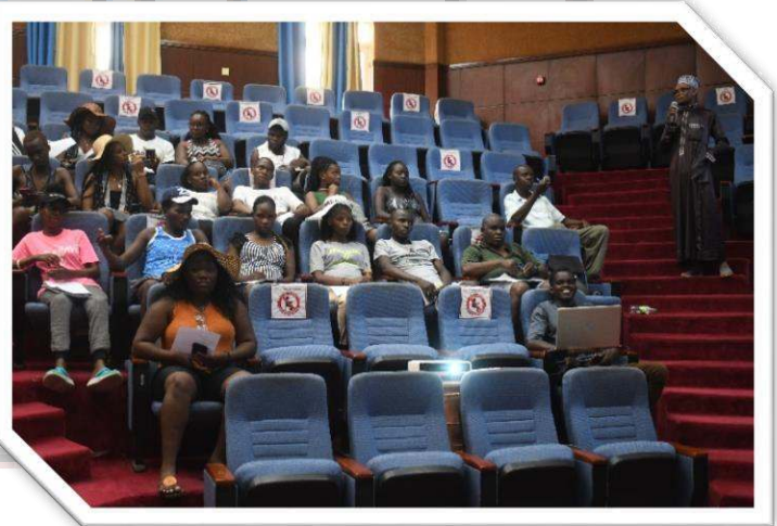
KMFR I hosts University of Murang'a students at her auditorium, Mombasa headquarters, during their educational tour of the Institute. They learnt more about KMFR I's research mandate under the Ministry of Mining, Blue Economy, and Maritime Affairs.