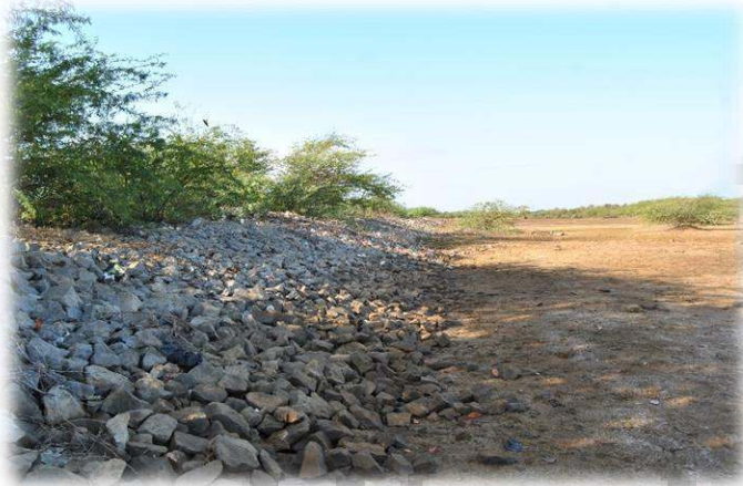
A poorly constructed seawall in Ngomeni, Malindi

Sea wall offers excellent coastal protection from erosion and coastal floods, and may save our national heritage sites. It performs flawlessly by establishing the land-sea border while giving the infrastructure next to the shores the same level of protection from the waters.