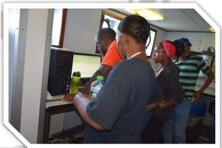
KMFRI research scientists onboard RV Mtafiti retrieve acoustic data

"The studies show there is a strong oceanographic and ecological connectivity between the North Kenya Banks upwelling and neighbouring Tanzania, Somalia