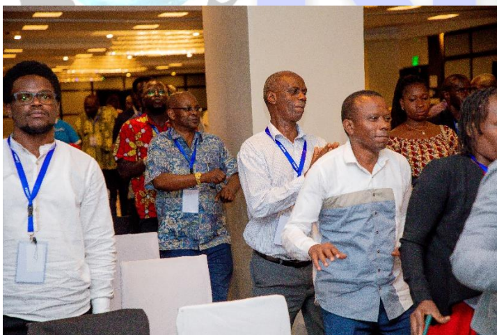
KMFRI staff attending the conference