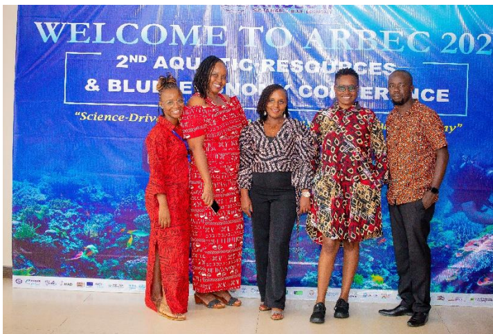
KMFRI staff donning African attire aligning with the day's ARBEC conference theme.

A PUBLICATION OF KENYA MARINE AND FISHERIES RESEARCH INSTITUTE (KMFRI) @KmfriResearch