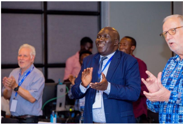
Participants at the conference

A PUBLICATION OF KENYA MARINE AND FISHERIES RESEARCH INSTITUTE (KMFRI) @KmfriResearch