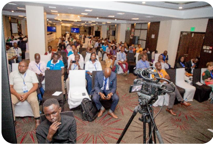
Participants follow proceedings during the launch of the Aquatica Journal