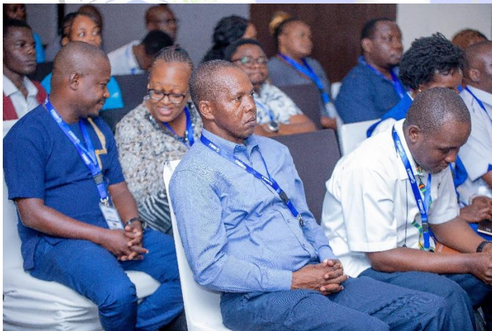
KMFRI staff attending ARBEC