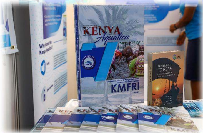
Displays of Aquatica Journal at the ARBEC conference

Kenya Aquatica is a peer-reviewed, open-access scientific journal published at the Kenya Marine and Fisheries Research Institute (KMFRI). The journal has been in the limelight since its inception in 2018. The year is historic considering its conception happened during the International Sustainable Blue Economy Conference (SBEC) held in Nairobi in November 2018.