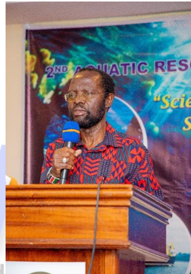
Kisumu Governor HE Prof Anyang' Nyong'o

Commissioner Madam Flora Mworora highlighted the numerous challenges facing Kenyan water bodies, including habitat destruction, and called for conservation and protection of Marine Protected Areas (MPAs). She said science can pave the way for sustainable