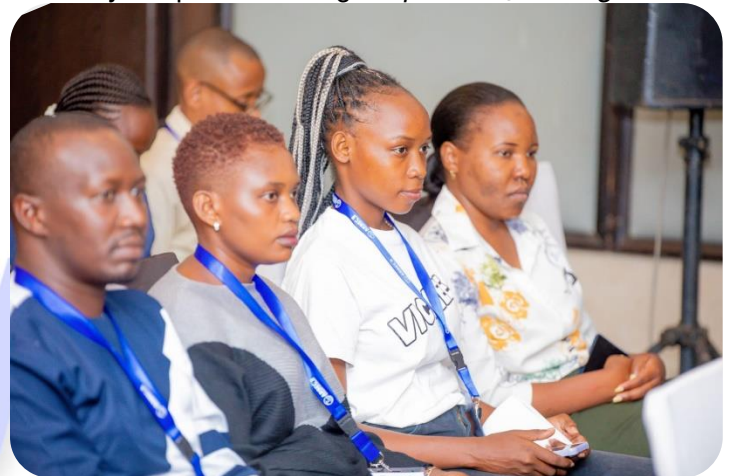
Participants during Aquatica launch