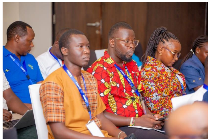
Participants follow proceedings