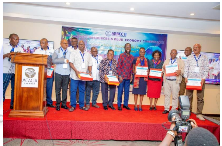
KMFRI BOM receives awards

Discussions centred on the role of data analytics, remote sensing, and emerging technologies helped to enhance understanding of aquatic environments and development; and implementation of science-informed policies that promote responsible resource utilization and conservation.