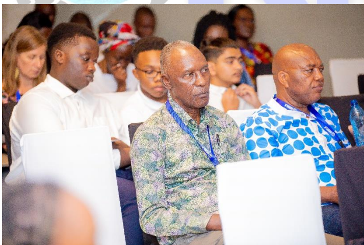
KMFRI researchers attending ARBEC II

Researchers involved in diverse Blue Economy sub-themes showcased innovative technologies and solutions that leverage scientific advancements, aimed