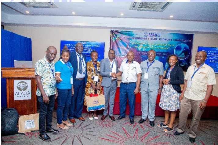
ARBEC II awardees