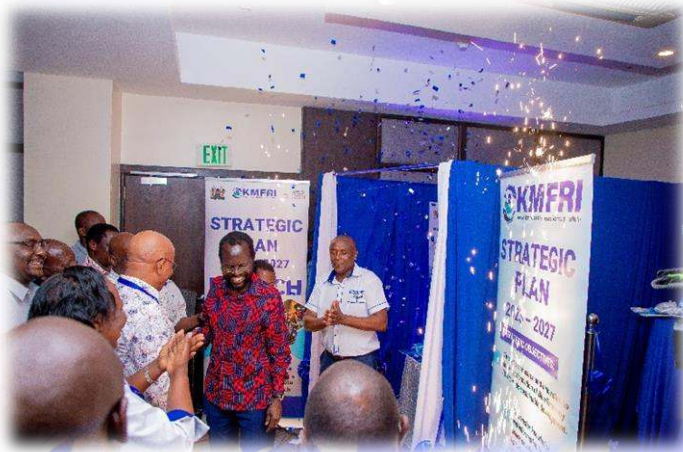
KMFRI's Strategic Plan launch

It was pomp and colour as Kenya Marine and Fisheries Research Institute (KMFRI) launched her Strategic Plan for 2023-2027 period.