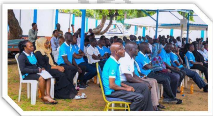
Staff follow proceedings