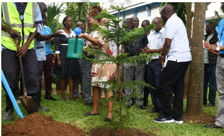
Blue Economy and Fisheries PS Madam Betsy Njagi plants a commemorative tree at KMFRI headquarters.