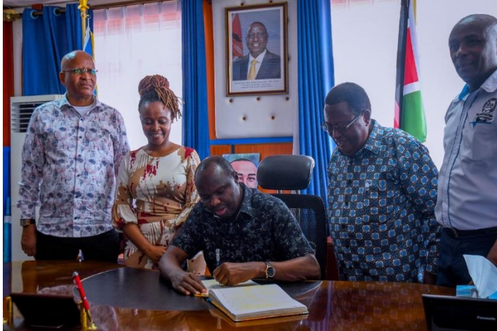
Head of Public Service Hon Felix Koskei signs the visitors book