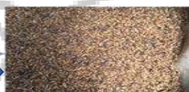
Insect waste management technology

In this study, waste collected from different sources was sorted manually to have a biodegradable for value addition.