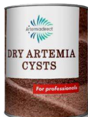
Artemia cysts collection at Kadzuhoni and processed cysts in cans