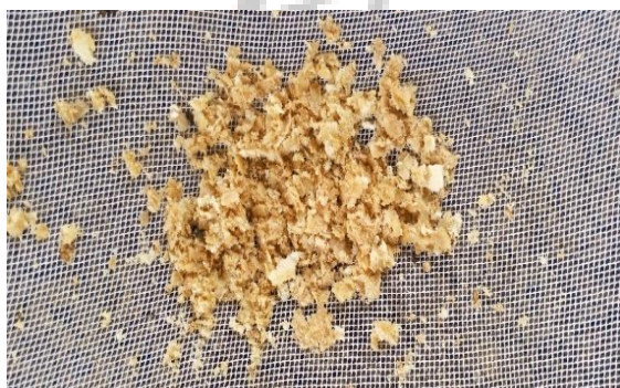
Harvesting of BSF eggs for hatching