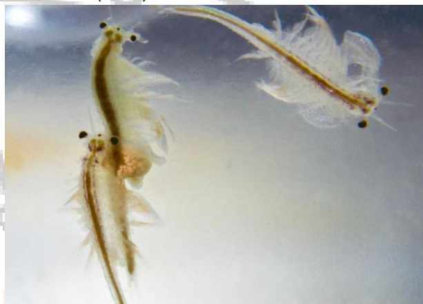
Adult Artemia during Courtship

KMFRI's Aquaculture team compared the salinity tolerance of a Kenyan Artemia population with its parental population from San Francisco Bay (SFB), and another commonly used Artemia from Great Salt Lake, Uta, USA (GSL).