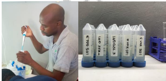
Feeding Artemia with microalgae

Hatched instar I nauplii were harvested using a micro sieve and concentrated in glass beakers. From the beakers, 30 nauplii were transferred in batches into centrifuge tubes with 30 ml of saline water at different salinities (35, 70, 105 and 140 g/l). Survival was assessed daily by physical counting of Artemia from each centrifuge tube. The nauplii stocked in the centrifuge tubes were cultured for 8 days on live algae cells ( Chaetoceros spp).