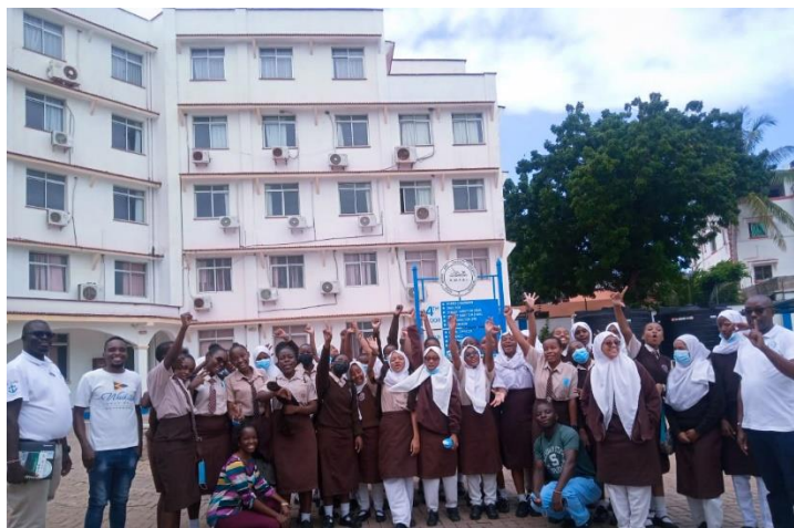
Students from Mama Ngina High School at KMFRI where they toured radioisotope lab to learn more about nuclear science