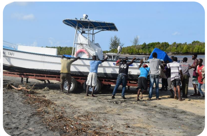
Young men help to launch KMFRI's research vessel in Kipini

Science technologies are so advanced today which makes it possible to generate critical data that can avert natural disasters and calamities. Tide table is one of those advancements which ensures we are not caught off-guard by natural occurrences such as extreme oceanic events.