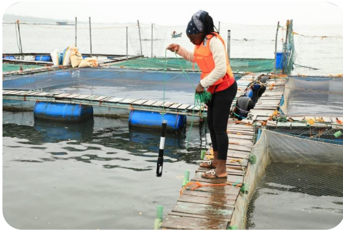
An officer conducting a water analysis to establish if there is pollution

The rollout of the Sustainable Activities in Water Areas (SAWA) project last year in Western Kenya served as a major boost to the local fish cage farmers, more so those on Lake Victoria.