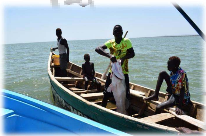
KMFRI Turkana station team during a research expedition on post-harvest losses on Lake Turkana