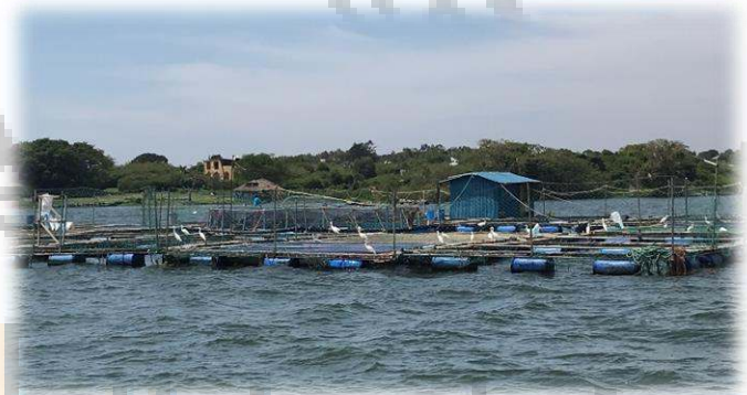
Image of sample cage farm in Lake Victoria

High-temperature levels of up to 28°C emanating from climate change effects may have further catalyzed the deaths of fish in the cages as the temperatures speeded up the decomposition of organic matter originating from within the lake and land sources such as fertilizers from farms, which deprive the fish of oxygen leading to their suffocation. The existence of cages in shallow zones (less than 10.0 m, mainly in the gulf) exacerbated the fish kills and death phenomenon due to minimal cases of water circulation (to generate more dissolved oxygen) and confined cultured fish with no room to escape.