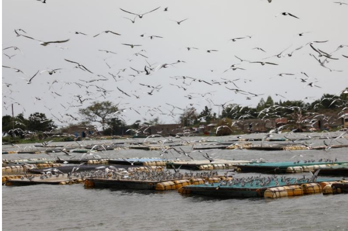
Sample image of cage farms at the shore of L. Victoria

Upwelling of the lake waters added to the phenomenon with pockets of this natural activity occurring in various spots in the lake (known as spotted upwelling – which is unpredictable and occurs many times and at any time).