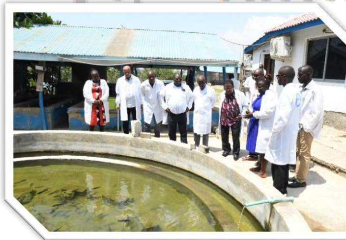
KMFRI BOM tour Mombasa station - fish ponds to understand how fish are reared to maturity.