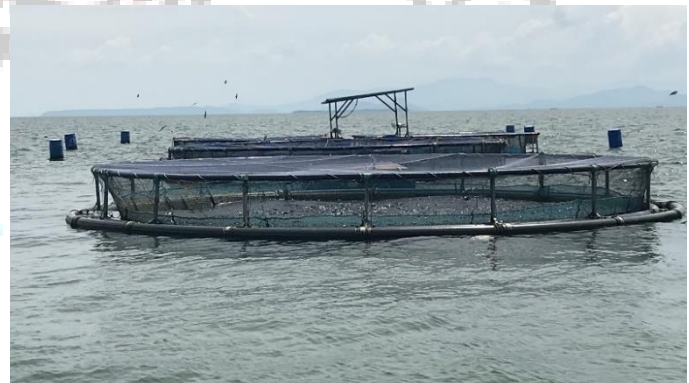
Image of a sample cage farm in Lake Victoria

They also advised that the farmers are given subsidies more on the retail price of fingerlings so as to help them bounce back to their income generation activities which enhances their livelihood.