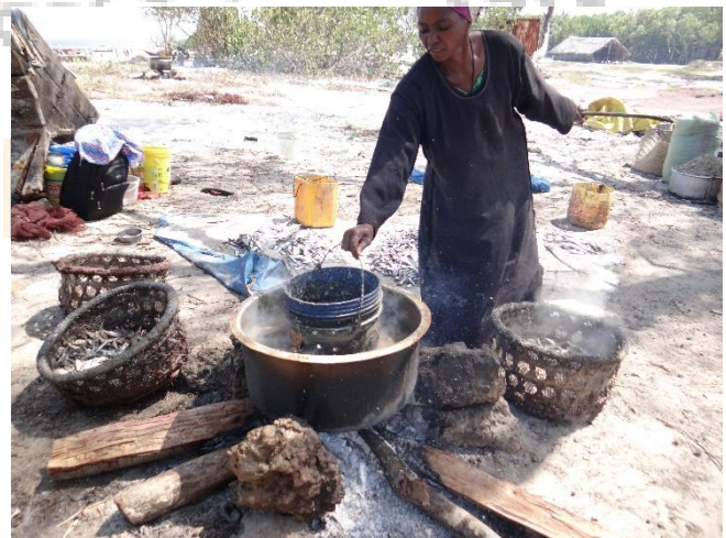
Fishfolk boiling sardines using plastic containers to prolong shelf life

Small-scale fisheries enhance food security and support the livelihoods of the coastal communities in Kenya. The sustainable exploitation of this resource is however threatened by high Post-Harvest Fish Losses (PHFLs) which occur across the entire fish value chain. The losses are occasioned by poor fish handling skills and inadequate preservation infrastructure.