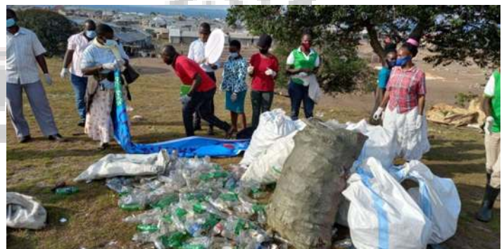
Sorting out plastic waste

KMFRI has rolled out positive initiatives to curb the widespread dumping of plastics in the ocean. During the 2022 International Coastal Cleanup Day, KMFRI stole the show. It had the best strategies to curb marine pollution. The function was organized by National Environmental Management Authority (NEMA) in collaboration with other organizations like the Kenya Wildlife Service (KWS), Kenya Marine Fisheries Social-economic Development (KEMFSED) Kenya Fisheries, and Kwale County government amongst other organizations.