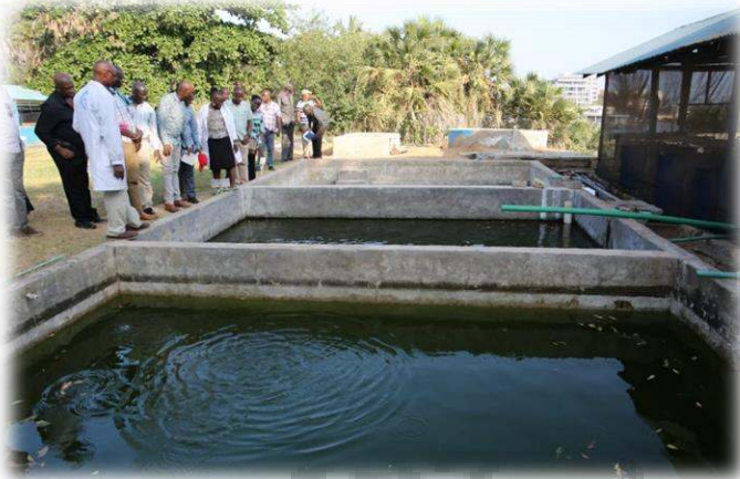
Student officers currently doing the Senior Joint Command and Staff Course at the Joint Command and Staff College tour KMFRI's experimental fish ponds during an official visit to the Institute. The students who were accompanied by Directing Staff learnt about KMFRI's mission and her role in harnessing the Blue Economy through research for the overall economic growth of Kenyan economy.