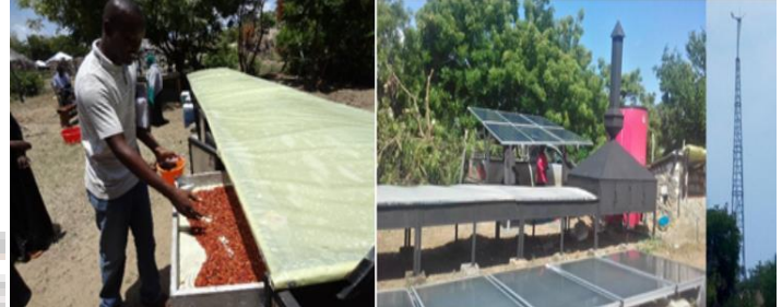
A man operates the improved hybrid windmill solar tunnel dryers installed in Kipini

Advances in drying have seen the development of rack dryers, solar dryers, solar tunnel dryers and the hybrid windmill solar tunnel dryer installed in Kipini.