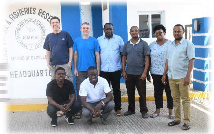
Attendees of the inception meeting for the project dubbed "Supporting marine small-scale fisheries sustainability as a basis for safeguarding Food Security and Livelihoods in East African Region (SAVEFISH)" at KMFRI headquarters.