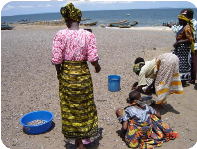
Fisherfolks sun-drying sardines on the ground

Women are compelled to shelter the drying fish every time it rains and each evening to avoid dew and its consequences such as moulds. Other disadvantages of natural outdoor drying include dust contamination, insect infestation, and exposure to harmful human and animal handling.