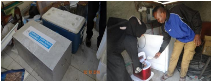
Light-weight insulated container used for storing ice and an ice production unit of the hybrid windmill solar tunnel dryer

Running a cold chain for flake ice production on green energy, and reducing energy costs is one sure way to sustain such a facility.