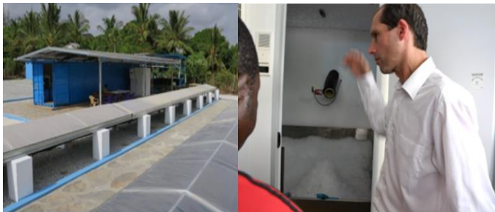
The Solar Drying and Cooling technology (SolCoolDry) at Mwazaro, Kwale County invented through multidisciplinary and multi-institutional collaboration

Two German Engineering institutions -The Fraunhofer Institute for Solar Energy Systems (ISE) and INNOTECH, and three Kenyan Institutions namely Kenya Marine and Fisheries Research Institute (KMFRI), Kenya Industrial Research & Development Institute (KIRDI), and the Technical University of Mombasa (TUM) - collaborated to design, implement and roll out a climate-smart innovation. The futuristic technology uses green energy to power fish drying system and for ice production to reduce post-harvest fish losses.