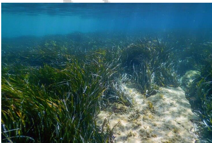
Seagrass image underwater

Seagrass rehabilitation began in 2015 after a baseline survey showed they were degraded. So far, around 10,000 seagrass seedlings have been planted in a 2.5 acre land in Kwale county.