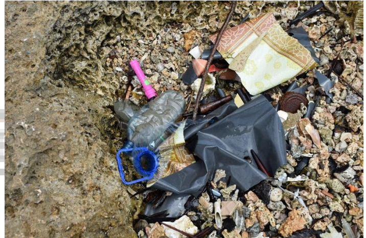
Plastic waste washed to the shore in Kwale

Other edible sea animals or fish can also eat the fishing net, and when humans consume such marine fish, it poses a health risk.