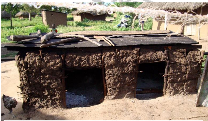
Sample image of a traditional smoking oven

Fish smoking is relevant in artisanal fisheries in that it prolongs the shelf-life of fish, enhances flavour and increases fish utilization; reduces waste when catches are good and increases protein availability to people.