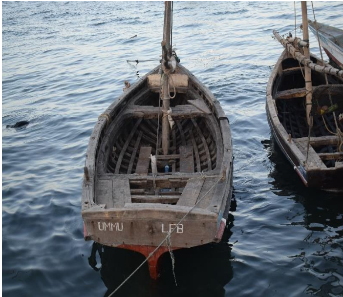
Artisanal boats used for fishing in Lamu