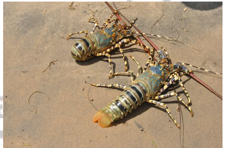
Lobsters caught at the North Kenya Bank / Photo by Milton Apollo

Data obtained by a team of experts from KMFRI suggest the fate of Tana River sediments might be at the deep edges of the NKB. It has now emerged that the recent crab fishery thriving on the deposited sediments is located along the deep edges of the NKB.