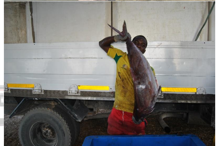
Top, a fisherman gets his share of red snappers shortly after the catch landed at Ngomeni. Below, a loader shows off a huge tuna before loading it into a truck. Tunas are high-value fish in Lamu.