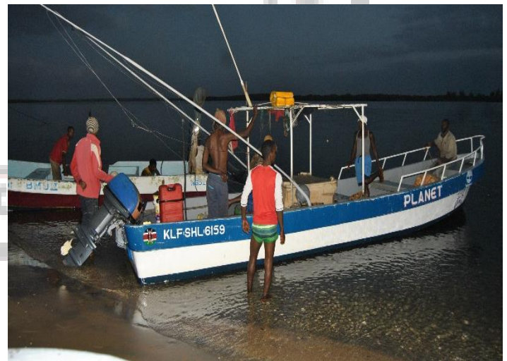
Ngomeni fishermen at dawn get ready to sail