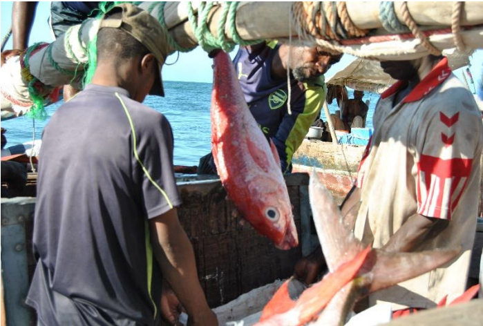
Fishermen offload iced red snappers from storage boxes in the fishing boats