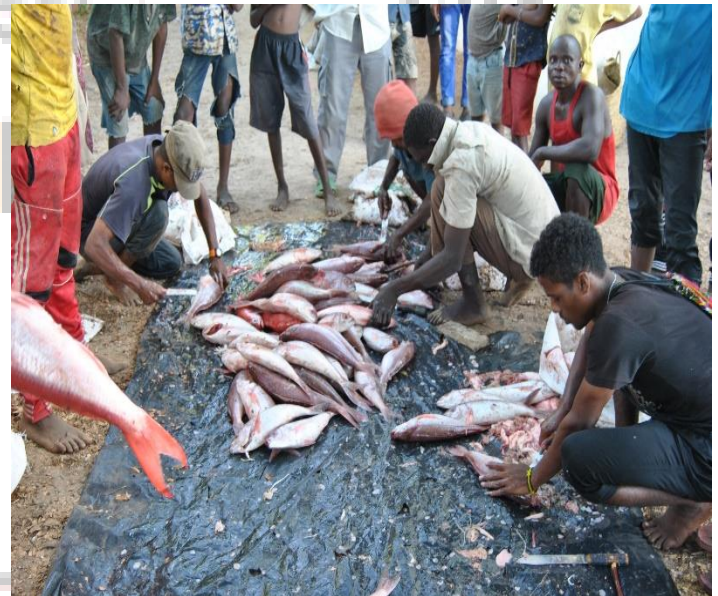
Youths gut landed fish

"More so the wind field, and the interaction of the current with the topography which may synergistically cause the upwelling to occur," Dr Kamau adds. The South East Monsoon and North east Monsoon seasons predominantly determine the physical processes the area experiences.