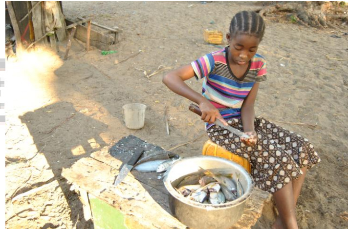
A girl prepares fish for cooking

complex system prone to a multitude of factors that may cause, or influence the strength of the shelf-edge upwelling," says Dr Kamau.