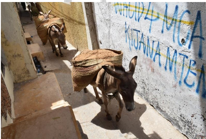
Donkeys in Lamu Town are the main mode of transport

And who knows, just like the great wildebeest migration, it might as well become a major attraction in Lamu besides the county's rich Swahili culture, stunning beaches, breath-taking architecture, lyrical Taarab music and hordes of donkeys that crisscross through the town's narrow pathways.