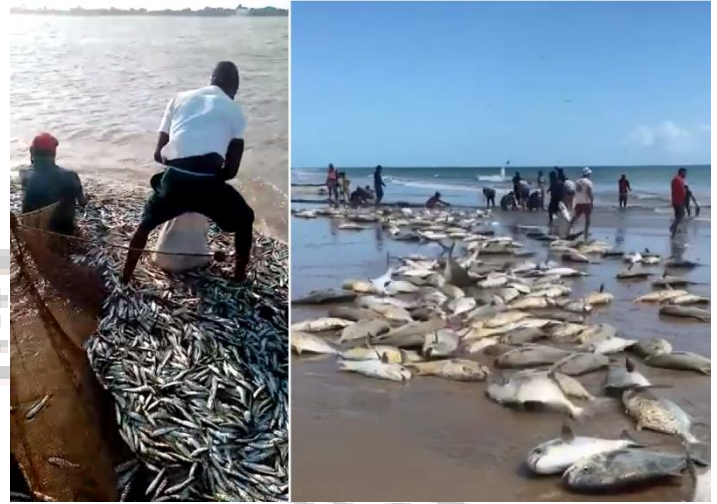
Beached sardine and predator fish in Lamu

Before I bring you up to speed, you probably watched the footage - an exhilarating short video that was doing rounds on Twitter and WhatsApp groups early July this year, showing small and large fish stranded on a beach in Lamu. In the video clip, fishermen could not help but collect the landed 'catch' that could only be likened to manna from heaven.