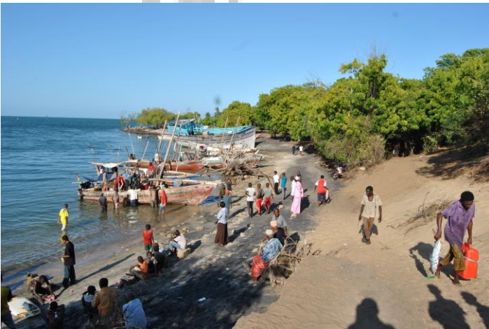
Ngomeni residents wait for the catch to land

Kenya's rich marine fishery grounds are mainly located in the Northern and Southern regions. The southern region borders the Pemba channel whose interaction with the features on Pemba Island helps to drive the surrounding marine waters productivity, research shows. The Island's geophysical features interaction with currents develop local eddies and wakes enhancing nutrients mineralization.