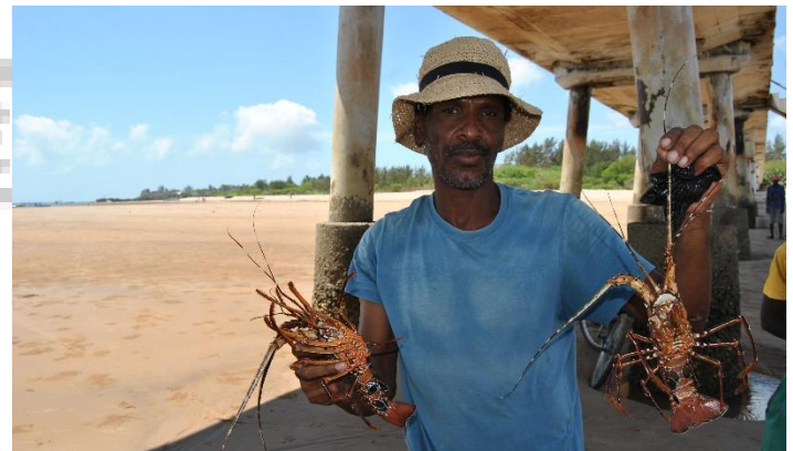
Ngomeni fisherman displays freshly caught lobsters