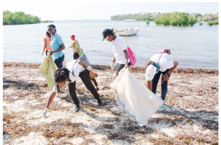
KMFRI team collect trash along the beach during low tide

On the other hand, tide information helps fishermen map their fishing zones to increase catches because some species congregate when water is either high or low. Accurate predictions can therefore cause fishermen to reap big in their fishing venture.