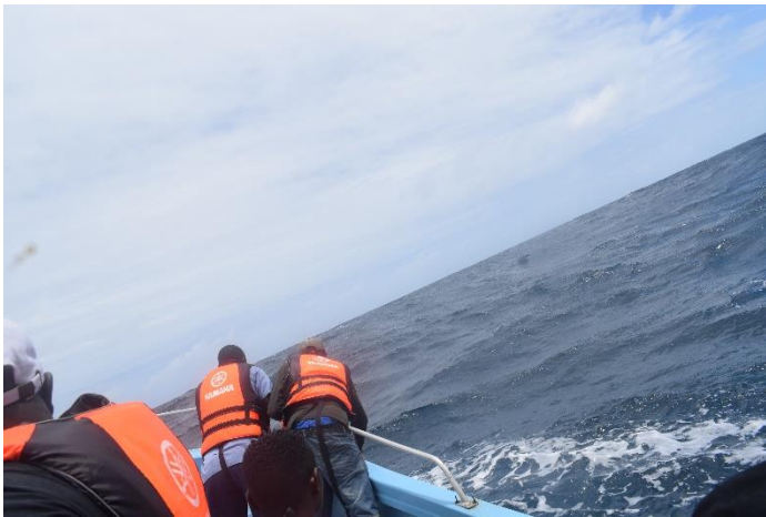
Tidal information is important for scientists on research mission

High tides occur when waters rise and move out of the sea and form what appears like 'crests of water in the sea' and low when waters fall and move back to the ocean. The coast experiences a high tide when the waves or crests reach the highest point. Waters are shallow during the low tide and deep during the high tide.