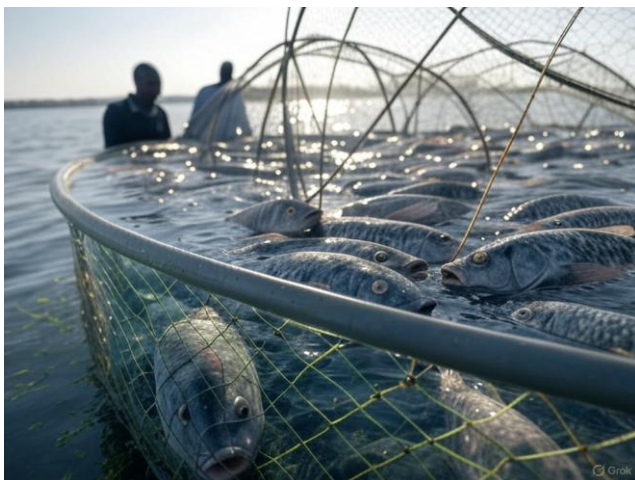
AI Image illustrating fish cage farming

A recent study by the Kenya Marine and Fisheries Research Institute (KMFRI) has raised serious concerns over the health of Lake Victoria, linking recurrent wild fish kills to eutrophication and increasing pollution. Published in the KMFRI Kenya Aquatica Journal (2025) , the study provides scientific evidence that the lake is experiencing growing environmental pressure, largely driven by human activities within its vast watershed. These findings reinforce long-standing warnings by scientists that declining water quality is threatening freshwater ecosystems, fisheries resources, and the livelihoods of millions who depend on the lake.