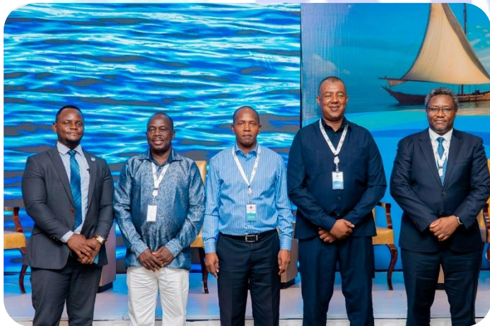
Participants of the Blue Voices Regional Summit