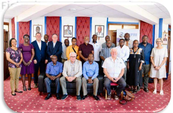
KMFRI senior staff and the members of the Belgian Government Delegation pose for a group photo