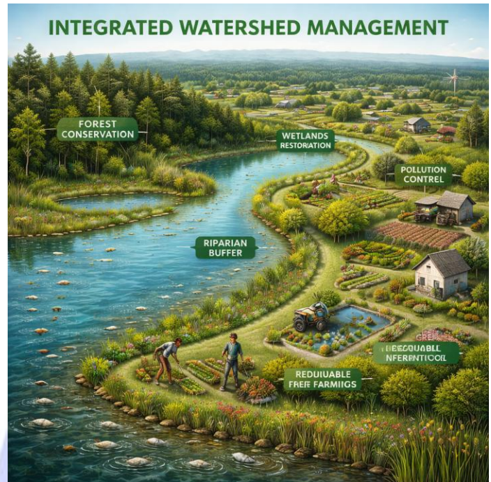
AI image illustrating Integrated Watershed Management a way to curb fish kills