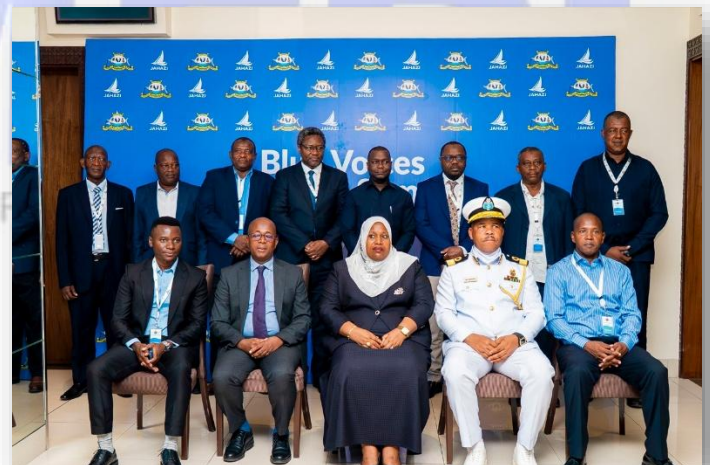
Participants of the Blue Voices Regional Summit pose for a group photo

The forum was organized by the Jahazi Project and co-hosted by the Government of Zanzibar through the Ministry of Blue Economy and Fisheries, it aimed at promoting collaborative solutions. These solutions range from enhancing data transparency and vessel tracking to empowering local communities, all with the goal of protecting our oceans and ensuring the sustainability of coastal livelihoods.