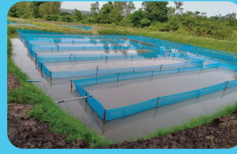
1) Hapa nets for fry Nursery