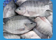
4) Table size mature brooders