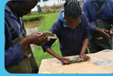
2) Tagging selected brooders