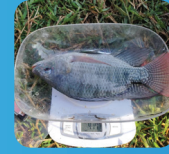
3) Monitoring brooders